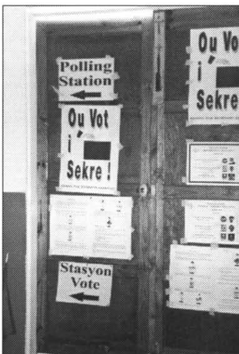
As part of voter education, posters reminding people that their vote was secret were put up