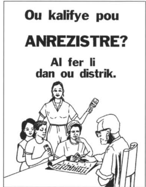
Poster urging people to register to vote

During our tour of our respective electoral districts, almost all the people we talked to were confident that they knew what to do on polling day. This was confirmed by our own observations on the three days of polling.